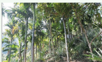
Homestead Agroforest in Assam