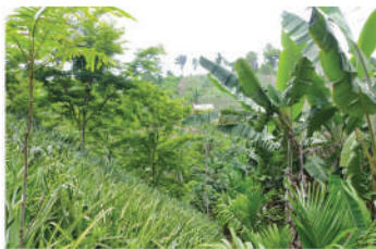
Siris-Agarwood Agroforest Cachar district, Assam