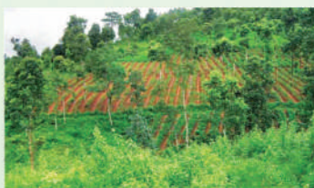
Tea-agroforest in Southern Assam