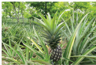
Pineapple-Agroforest, Cachar district, Assam