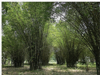
Bamboo Agroforest, Assam