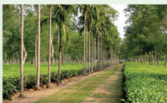
Tea-agroforest in Southern Assam